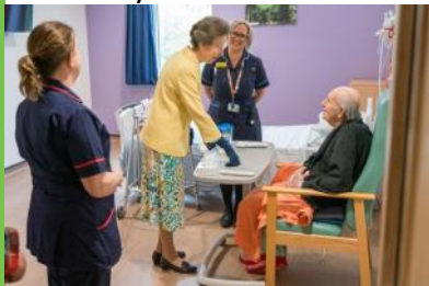
HER ROYAL HIGHNESS THE PRINCESS ROYAL AT THE FOREST OF DEAN COMMUNITY HOSPITAL

Do visit our news page on our website where we share news on community hospitals across the UK. This is a summary of some of the most recent news stories.